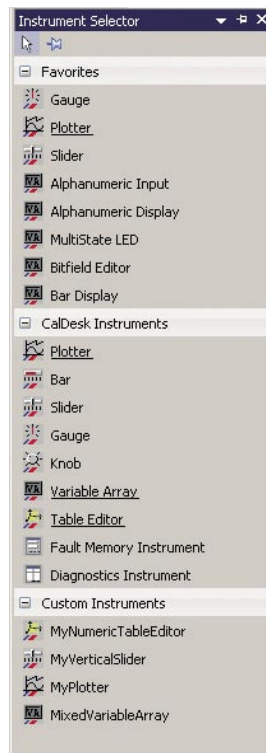
◀ The new instrument library, shown here with custom instruments preconfigured by the user.

Thus, XCP on FlexRay is already under development and will be available for the first customer projects in the course of this year.