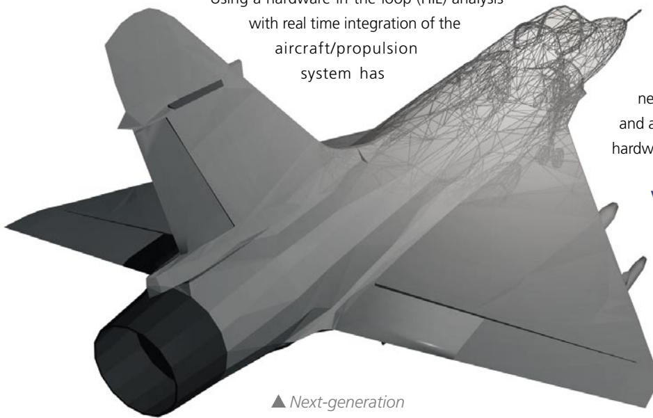
▲ Next-generation aircraft will benefit from optimized turbine engine controls developed with the aid of dSPACE Simulator.

complemented by a real-time aircraft simulation.