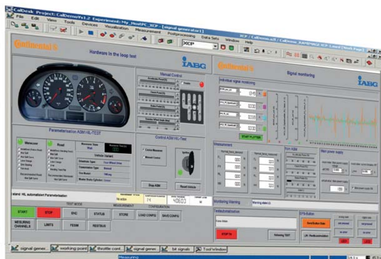
ControlDesk layout for controlling the test system.