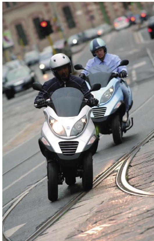
▲ The MP3 provides a tilt angle of up to 40°.

Edoardo Ruggiero, Piaggio Pomigliano d’Arco, Italy