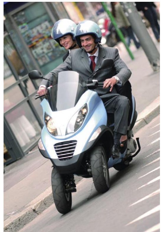
▲ The three-wheeler MP3 scooter from Piaggio.

If these conditions are not reached after a certain time span, the lock request is