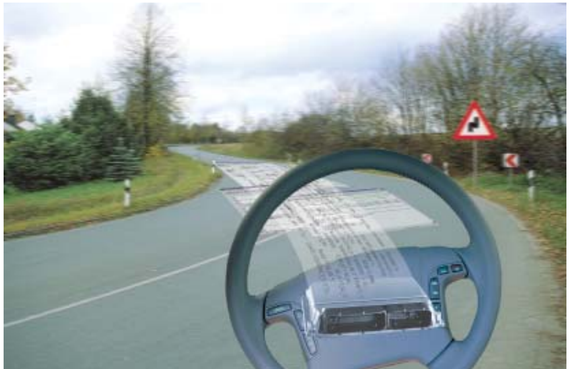
▲ ATENA Engineering uses know-how from the aviation industry for safety-critical automotive electronics.

At ATENA Engineering, we have many years of experience in developing safety-critical systems in the aviation sector through close cooperation with our parent company, MTU Aero Engines GmbH. MTU Aero Engines GmbH develops and produces the engine controllers for a number of European aviation projects. The aircraft engine controllers are multichannel electronic control units (ECUs) with between 4 and 10 processors and have to meet tough safety requirements. The standard governing