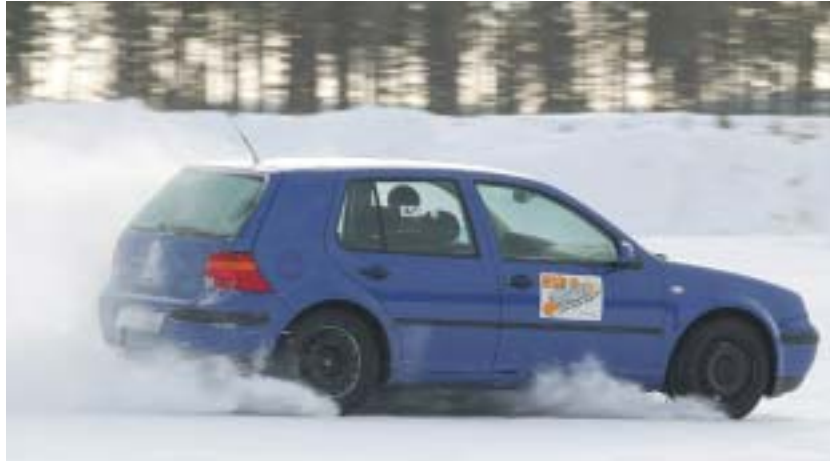
▲ The prototype vehicle with ESP II handles the most difficult driving maneuvers in winter tests in North Sweden.

Because the steering system is integrated into the yaw control as well as the brakes, ESP II has an extra means of acting on horizontal vehicle dynamics