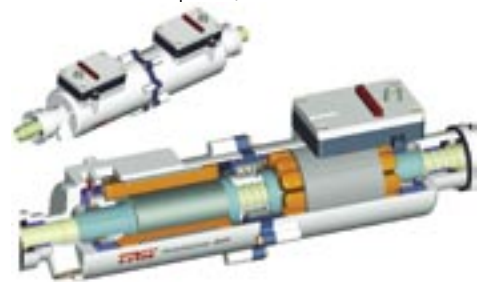
▲ Steer-by-wire front axle actuator.

functions are maintained. The subsystems have their own electronic control units (ECUs) and are networked via a real-time-capable, fault-tolerant data bus.