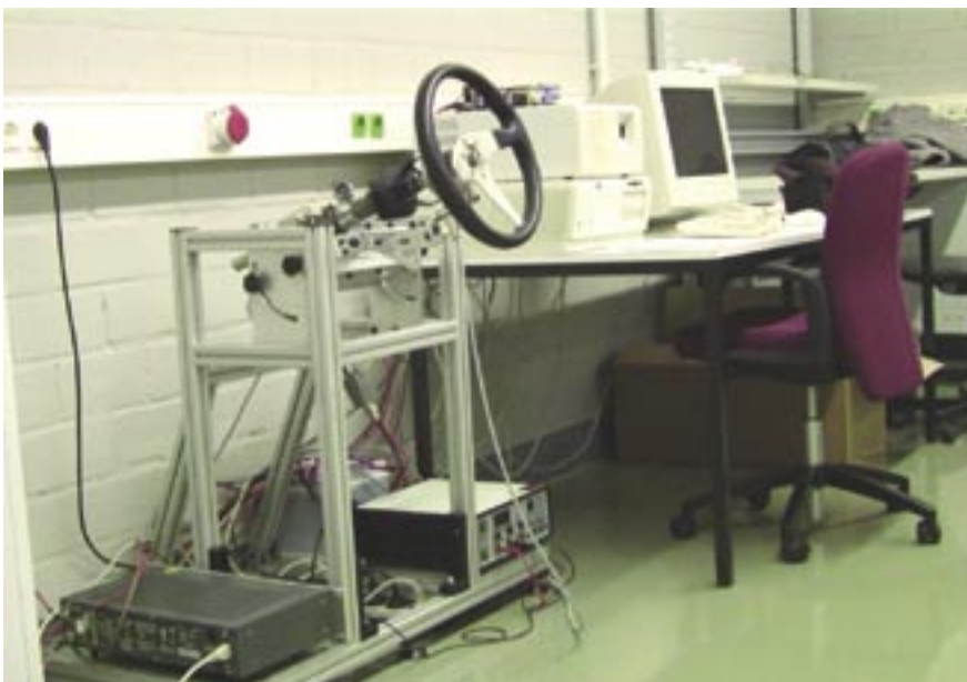
▼ CIL test bench with force feedback actuator.