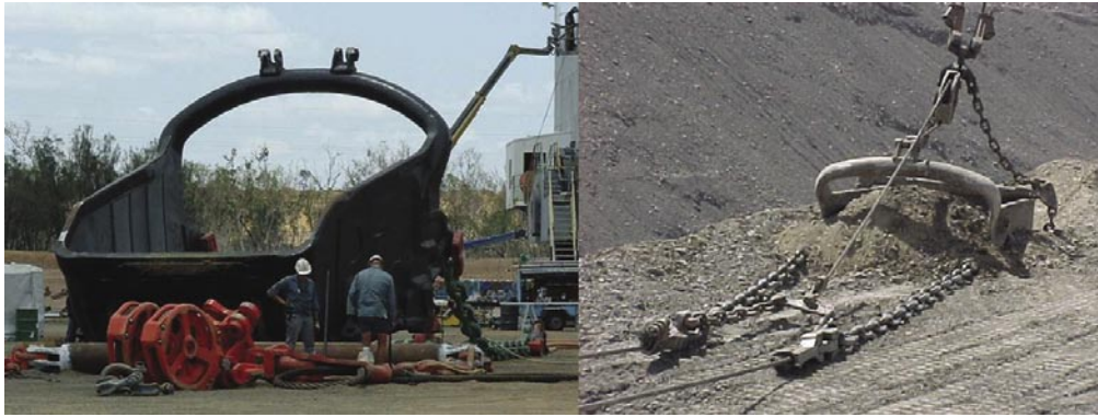
◀ The bucket for scooping up overburden: Weight 40 tons when empty, 120 tons when full.

the bucket carry angle. A frequency response analysis of the in-plane pendulum dynamics of the bucket and rigging shows a system with several sharply defined resonances. Other problems are the non-linear behavior of the bucket-rigging system and the changes in the dynamic characteristics as the bucket moves through its workspace.