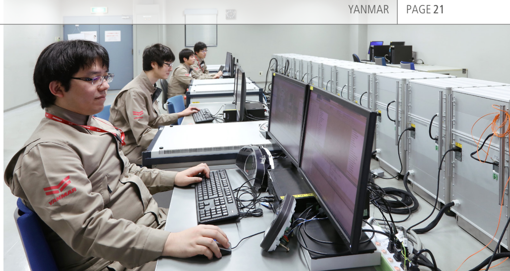
A set of standardized Processor/Power racks and Master I/O racks

The flexible and extensible dSPACE SCALEXIO system contributed to the