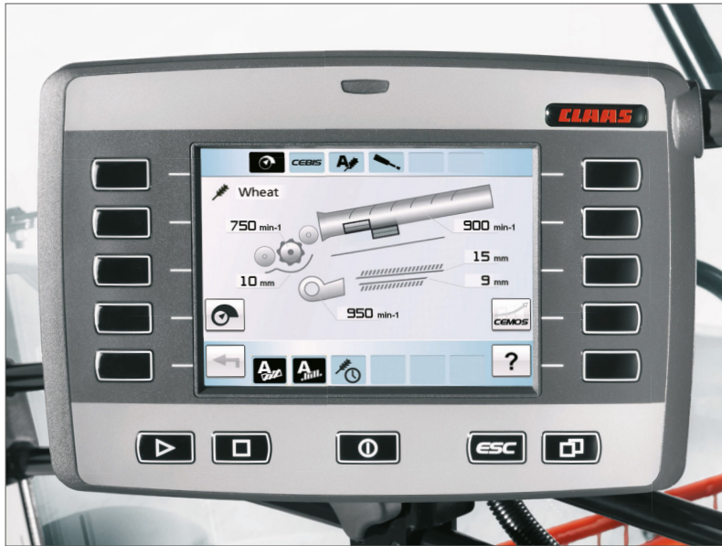
The graphical user interface makes entering objectives easy.

>> sary machine functions are designed according to the principle of a distributed automation represented by one overall model. This complex model has a size of 50 megabytes. Task control and the communication between the system functions are based on the OSEK (Open Systems and the Corresponding Interfaces for Automotive Electronics) operating system. The OSEK module for TargetLink is used to define interfaces and tasks. The developed assistance function therefore only has to be connected to the existing environment.