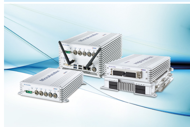
MicroAutoBox II: Universal, real-time-capable development system with the extensions Embedded PC (center) and the RapidPro SC Unit, which provides signal conditioning (right).

What if your ECU software is not based on AUTOSAR? You can also set up seamless tool chains and processes for non-AUTOSAR software. For more information please contact our experts by e-mail to rcp@dSPACE.de .