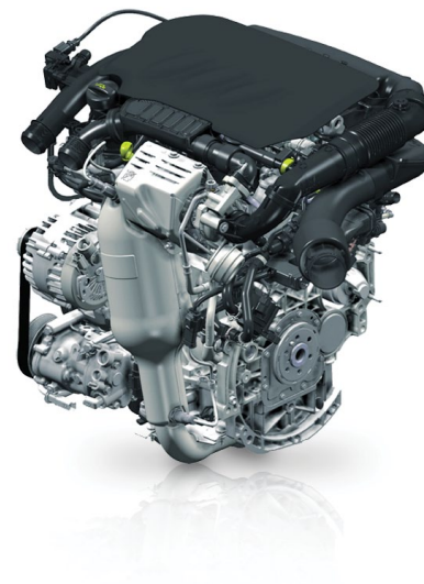
The software for PSA engine ECUs is developed with TargetLink and SystemDesk.

The individual TargetLink models for implementing the functionality of individual components can vary greatly in size, with the largest SWC models containing up to 6000 computation blocks. For the actual control design, a proprietary PSA library is used in addition to TargetLink blocks. The library contains functionalities such as counters and filters, and TargetLink's scaling invariance features are also partly used. To ensure high model quality, modeling guidelines from the following bodies are applied: MathWorks®, dSPACE, and PSA. Either floating-point or fixed-point code is generated depending on the project, and also on the complexity and required precision.