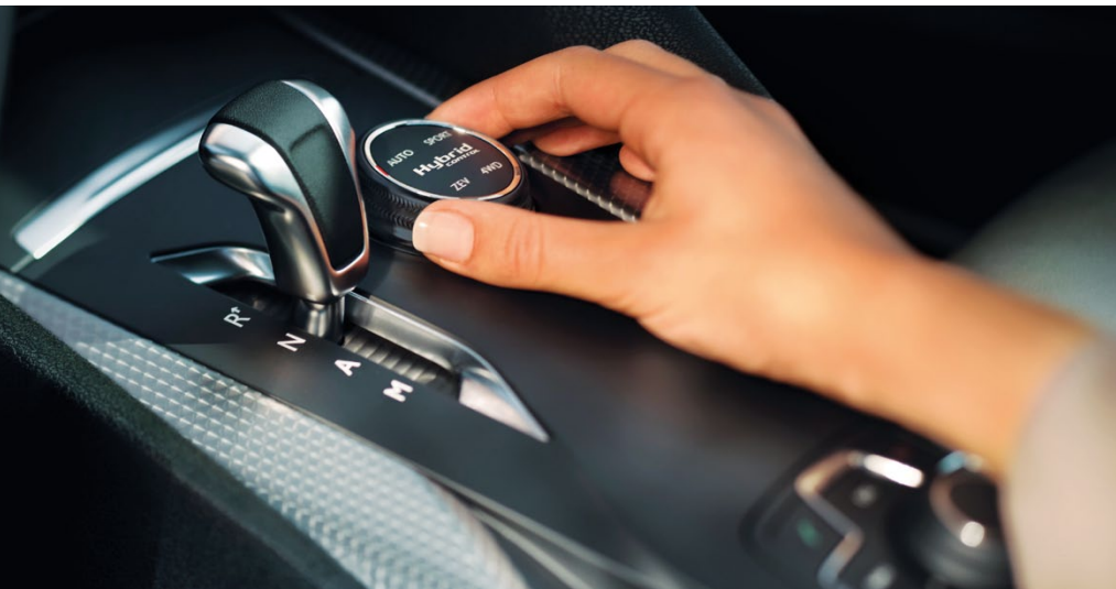
The software in PSA engine ECUs supports functions for combustion engines, hybrid controllers and transmission applications.