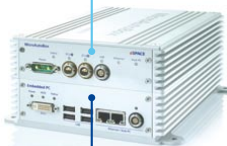
Figure 1: Everything in one box – the new MicroAutoBox II with integrated Embedded PC and Ethernet switch.

The desire for greater road safety and less CO 2 emissions is a major force for innovation in the automotive industry. A prime example is the increase in development activities for advanced driver assistance systems in new generations of vehicles. Reliable recognition of the vehicle's environment and traffic