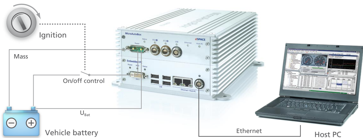
Figure 2: All-rounder – dSPACE MicroAutoBox II with integrated Embedded PC and characteristic simple wiring and numerous switching options for autonomous operation.

situation is at the heart of such systems. Capturing data by video cameras and video processing are essential in this context, as well as covering greater ranges ahead of the vehicle. One approach to this is based on the predictive evaluation of digital road maps. Another relies on communication between the vehicle and its environment via WLAN or mobile communications.